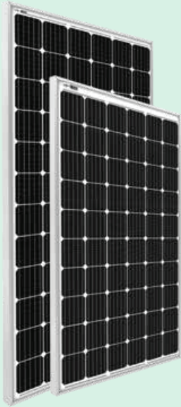
*Module images for representation purpose only